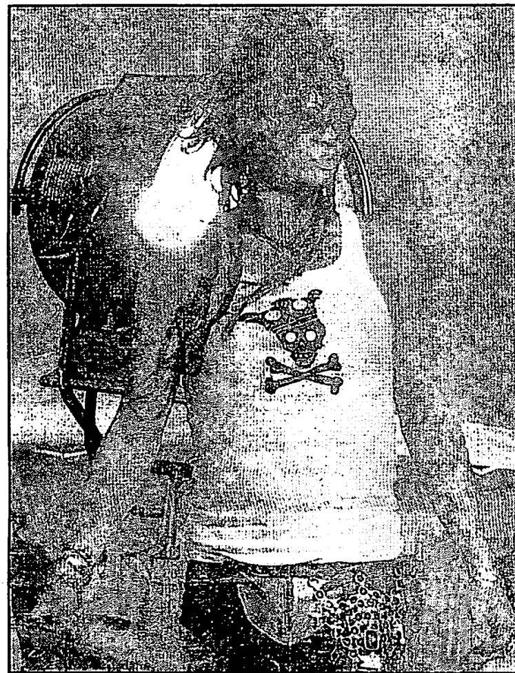
Steven Tyler strikes a pose.